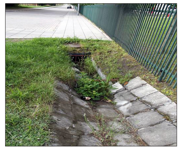
Figure 3. Wastewater discharge into the sewer drain (IV sampling point)

snow cover was still present on the soil layer, while repeating the tests after 4 weeks during the thaw. Samples marked as 7 to 9 were obtained when a layer of snow was already low. Studies were repeated after 4 weeks when there was no snow, and there was no rainfall for a long time.