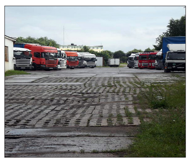
Figure 4. Parking lot near the VII sampling point

The highest value of COD (Table 1) was recorded during the collection at the point No 2, where it amounted to 1500 mg O_2/dm^3 and at point No 3 with 732 mg O_2/dm^3 . When the measurements were repeated, COD values decreased or increased for some points, which could be due to uneven penetration of additional organic pollutants into the waters. The lowest values occurred during the second sampling at points 7, 8, and 9. Rain did not occur then for a long time, which could indicate a lesser contamination along with runoff. For the points No 5 and 6, the atmospheric conditions were different, which resulted in uneven penetration of contaminants into the groundwater.