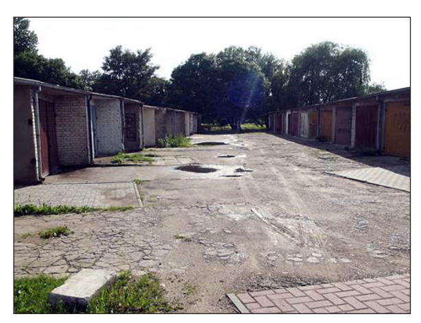
Figure 1. Residual water at the garages in the vicinity of III sampling point