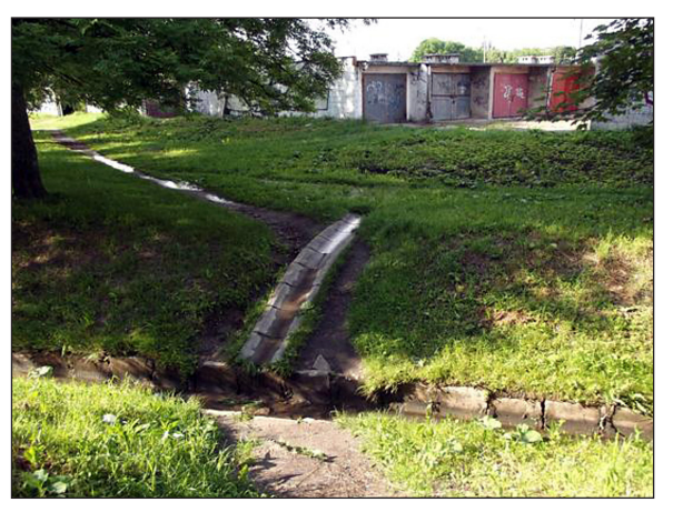
Figure 2. Wastewater discharge from garages area into the studied receiver (III sampling point)